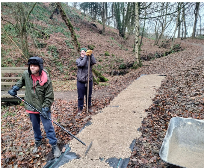
Our volunteers hard at work laying the new path

Now there's just the small matter of an access audit report to write, two films to make and two power chair hubs to set up by the middle of March. Piece of cake! We will report back on the final project in the next newsletter.