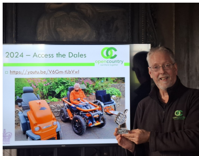
Virtually presenting the award to Access the Dales

Much inspired, we returned to the hall to discuss how we have all contributed to a more inclusive countryside, and how there is a growing movement to 'bin the barriers' which discriminate against so many people on paths and cycle routes.